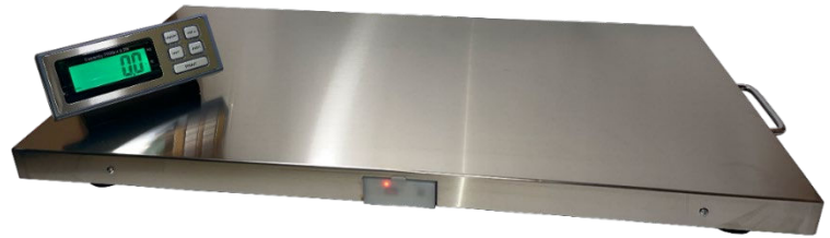
LVS + 700 / LVS XL + 700